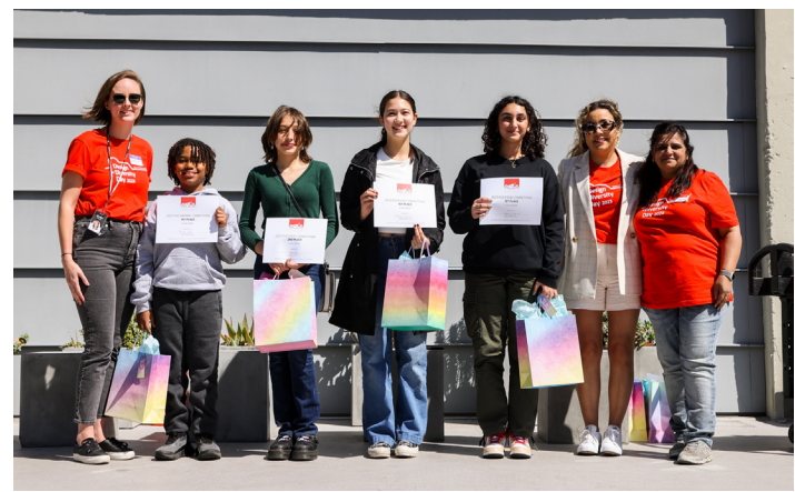
DxD 2023 Competition Award Winners.