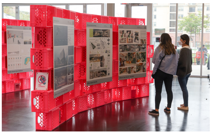
DxD 2022 Exhibition hosted by 2x8.